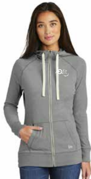
Shadow Grey Heather