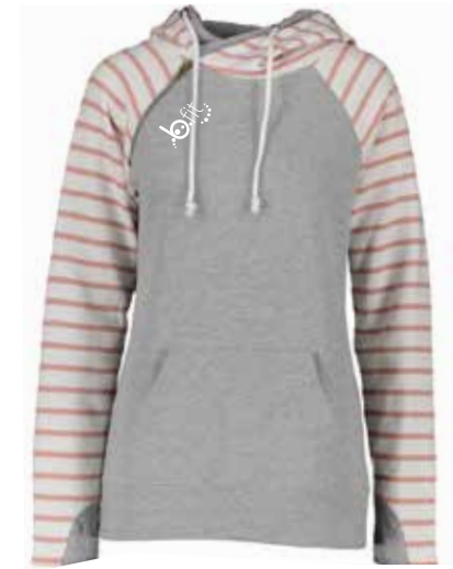
Rose Sand/Athletic Heather