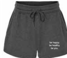
black, black camo heather, blush, dusty rose, forest camo heather, misty blue, sage, shadow