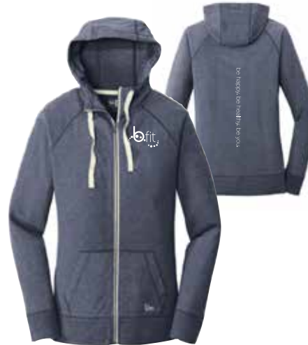
True Navy Heather