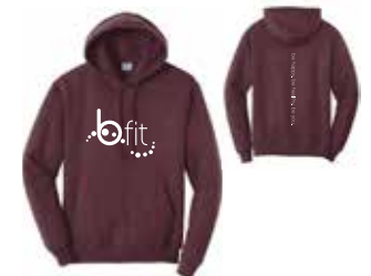
heather athletic maroon