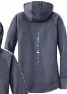
True Navy Heather