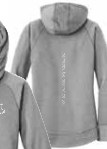
Shadow Grey Heather