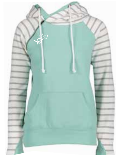
Faded seaglass/grey/white stripe