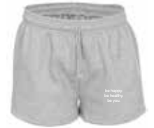
black, royal, red, charcoal, navy, oxford