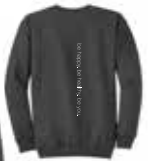
dark heather grey