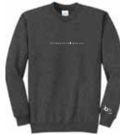
dark heather grey