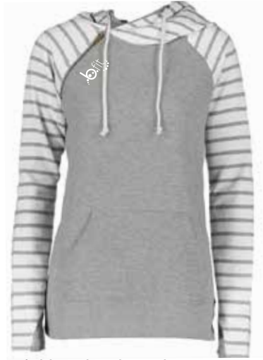
Athletic heather white stripe